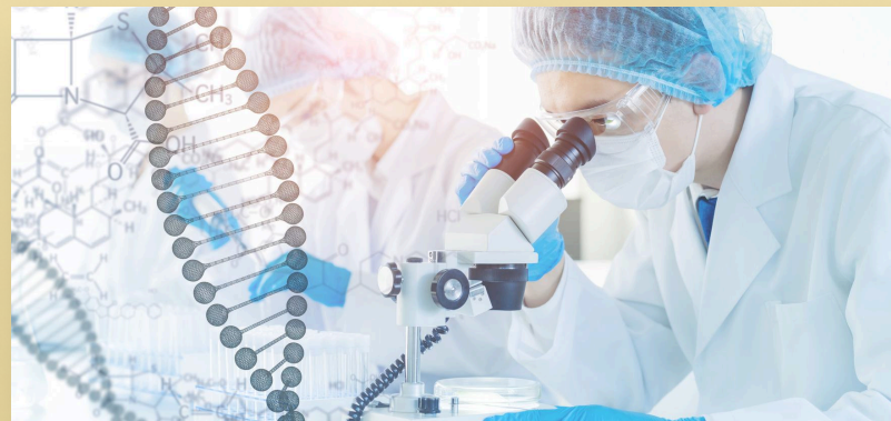
iPS cell therapy

Regenerative medicine is cutting-edge medical treatment that harnesses the natural healing power that exists within everyone. Because it uses your own stem cells, it is highly safe and does not cause side effects such as allergies or rejection reactions.