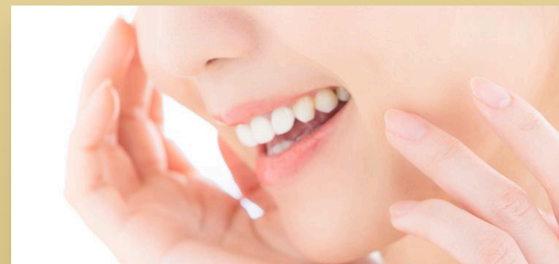
Dental regenerative medicine